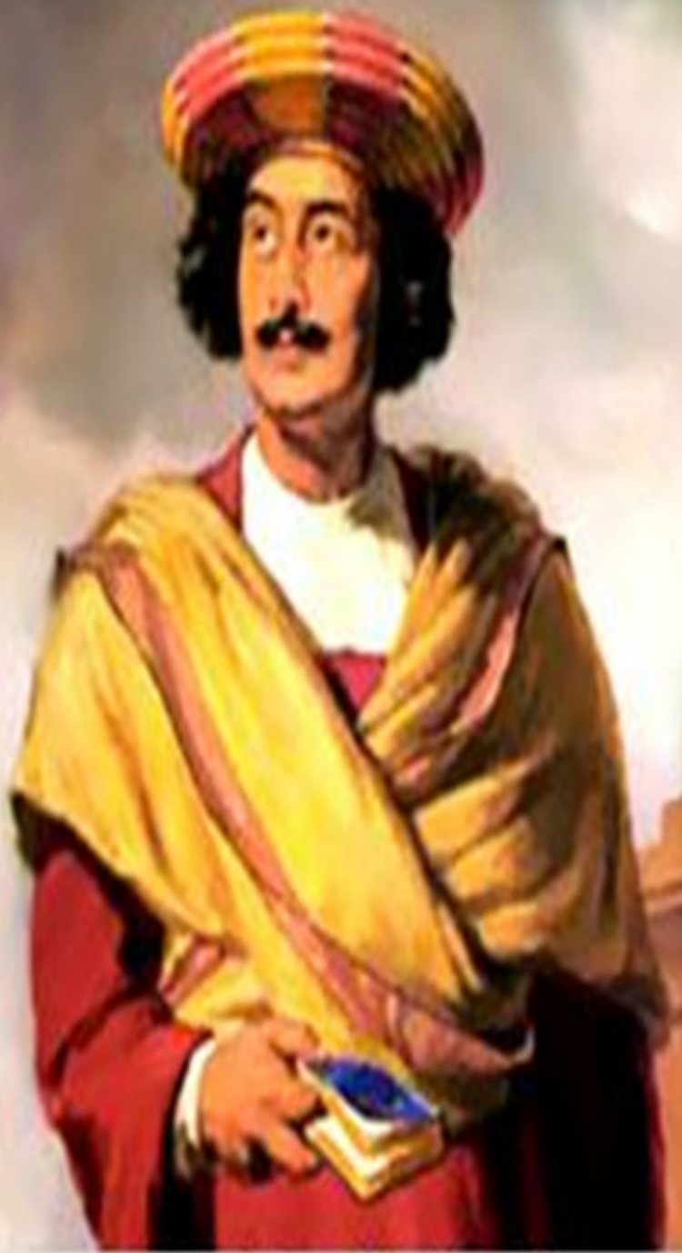
Raja Ram Mohan Roy